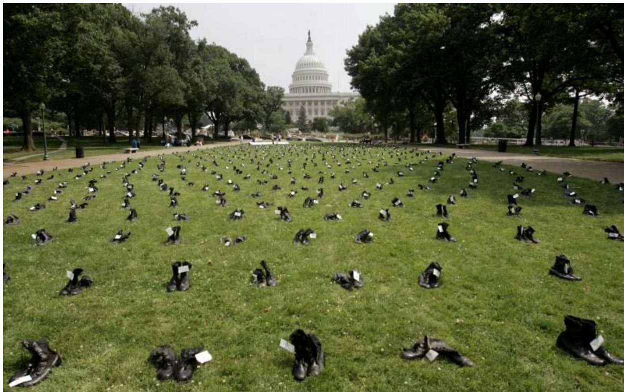
Combat boots bearing the names of some 800 U.S. soldiers killed in Iraq, May 25, 2004.

The Iraq Syndrome has played a role in U.S. politics for nearly a decade. As I wrote in 2005 , public support for the war in Iraq followed the same course as for the wars in Korea and Vietnam: broad acceptance at the outset with erosion of support as casualties mount. The experience of those past wars also suggests that there was nothing U.S. President George W. Bush could do to reverse this deterioration -- or to stave off an "Iraq Syndrome" that would inhibit U.S. foreign policy in the future.