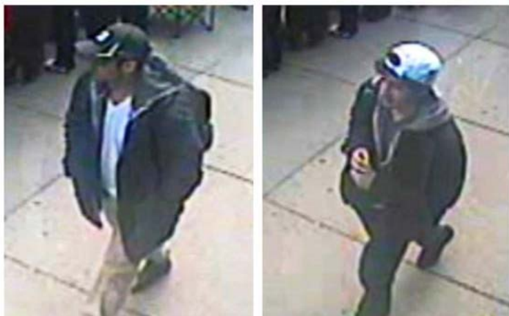
Tamerlan (left) and Dzhokhar Tsarev are seen in handout photos presented during an FBI news conference in Boston, April 18, 2013.

Posted Monday, April 22, 2013, at 6:39 PM