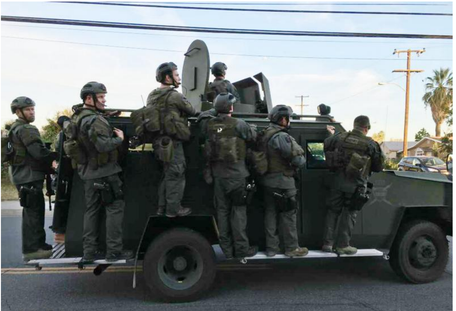
A police SWAT team conducts a manhunt after a mass shooting in San Bernadino, Calif...

Poll data on beliefs about which side was winning the war against terrorism has bounced around quite a bit, particularly in response to the wars in Afghanistan and Iraq. Overall, though, public opinion was almost exactly the same in 2011 as it was ten years earlier. The percentage maintaining that terrorists remain capable of launching “another major attack” was, if anything, higher in 2013 and 2014 than in 2002.